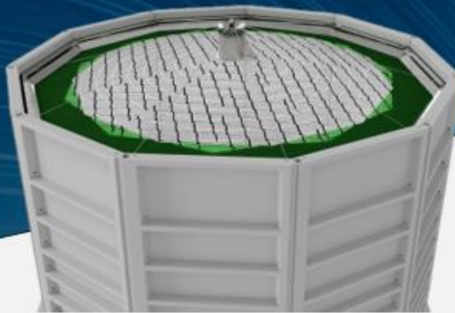
* Top-down view Grading Net for Purge

Scalable Grading Net for Purge, designed for new or existing land-based aquaculture facilities. It can be used as splash/ jump net, and for gentle fish movement of crowded fish before slaughter. The Net can be attached to a crane system rail, so it can be raised or lowered into the fish tanks.