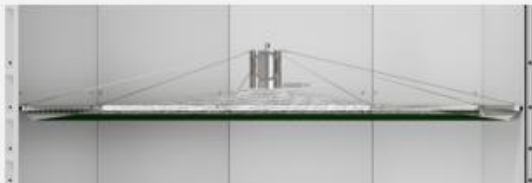
* Front section Grading Net for Purge